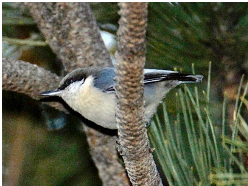
Pygmy Nuthatch

You may recall that we are in a friendly competition with over 2500 other CBCs across the Western Hemisphere with regard to our numbers of Mountain Chickadees and Pygmy Nuthatches. We have been Mountain Chickadee world champs for over a decade, and we've been Pygmy Nuthatch world champs a few times in that same period. DRUM ROLL, PLEASE – We are currently very well placed to be champs for both species this time around. Our highest previous count for Mountain Chickadees was 886; this year we had 1,028! Generally, a count over 500 puts us in the running. As for Pygmy Nuthatch, our highest previous count was 1,046; this year we had an incredible 2,182! We won't get the final analysis of this year's CBCs from National Audubon until next December, but I'll eat my hat if we don't come out on top for both of these species.