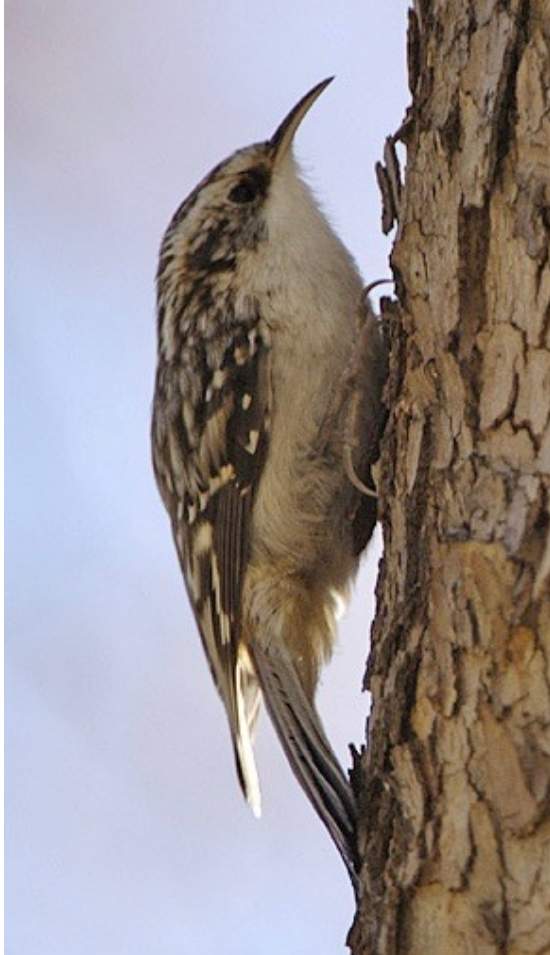
Brown Creeper

With the dawn of this year's Evergreen-Idaho Springs Christmas Bird Count (CBC) the main event impacting those of us in the field was the wind gusts over 60 mph that, at least initially, hindered our ability to find any birds. However, by the end of the day our 74 field workers in 33 separate groups (which is about our average) had managed to amass a total of 6,868 birds – a thousand more than we've been getting in recent years. So, kudos to the field workers that managed to brave the winds and find some birds! Once again, our Squaw Pass team lead the charge with fourteen participants in seven groups, hiking 14.7 miles and logging 23 party-hours.