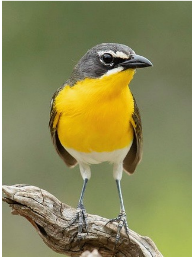
Yellow-breasted Chat – One of the many neotropical migrants found on Bird-Friendly coffee farms.

Among these coffee certifications are Organic , which is coffee grown without most synthetic pesticides and fertilizers, and is fairly sustainable. However, there are no criteria for shade cover, hence the shade can be quite sparse, or if present it may be provided by a variety of non-native plants, e.g. banana. A second certification is Fair Trade , which seeks to ensure that workers on coffee farms get paid fairly for the work they do and that farmers get a fair price. However, it does not require any particular environmental practices. A third certification is Rainforest Alliance , which requires some shade, but it can be as little as 30 percent. A fourth term that we see used as a selling point, but which is not a certification, is Shade Grown . This term arises from the fact that coffee historically was grown on small farms beneath the shade of extensive forests. Unfortunately, Shade Grown has become a marketing buzzword that says little about the actual growing conditions which may include fertilizers, pesticides, and a sparse cover of banana trees.