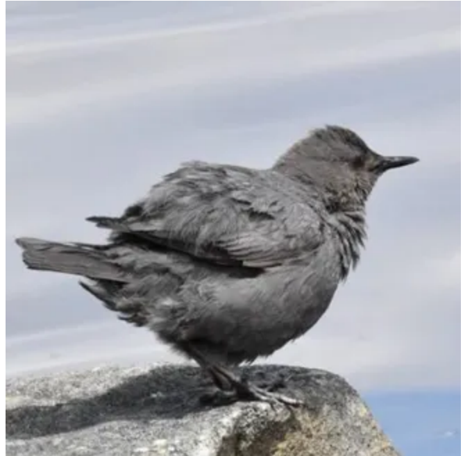
American Dipper Near Evergreen Nature Center