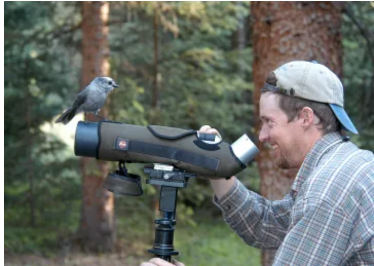
Canada Jay and Bill Schmoker

Each year roughly 45 Christmas Bird Counts (CBC) are conducted in Colorado. Each of these is an all-day survey conducted by folks of all levels of birding skills to try and determine the total number of bird species and individual birds within a fifteen-mile diameter circle. Some counts are conducted by just a handful of people, and others can have well over one hundred participants divided into separate groups. Our Evergreen/Idaho Springs count usually has around 50-80 participants. Some of these folks spend a good part of the day being outside, others are happy just to watch the birds that come to their feeders from the comfort of their home. To learn more about our Evergreen count on Dec 15 th this year and how to participate please go to: