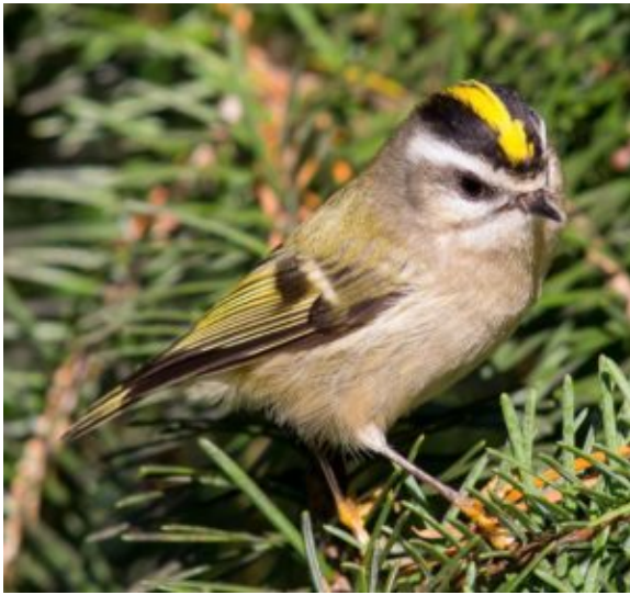
Golden-crowned Kinglet

confirmed Warbling Vireo, White-breasted Nuthatch, and Golden-crowned Kinglet.