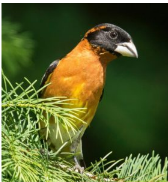
Black-headed Grosbeak