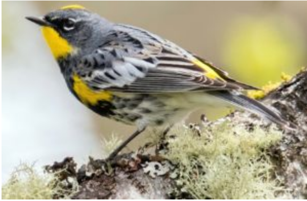
Yellow-rumped Warbler

Breeding is confirmed when we find a used or occupied nest, when parents are seen carrying food or feeding young, when a nest is found with eggs or young, or when we see a recently fledged bird out on its own. An in-depth analysis of our data will be forthcoming later this winter, but in the meantime here's a sampling of some of the breeding-confirmations that were made by this year's incredible crew of volunteers.