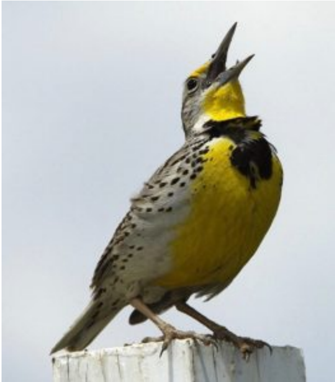
Western Meadowlark

Breeding is confirmed when we find a used or occupied nest, when parents are seen carrying food or feeding young, when a nest is found with eggs or young, or when we see a recently fledged bird out on its own. An in-depth analysis of our data will be forthcoming later this winter, but in the meantime here's a sampling of some of the breeding-confirmations that were made by this year's incredible crew of volunteers.