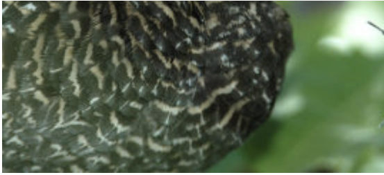
Dusky Grouse

We have just completed our tenth year of gathering data on the local breeding bird community throughout the Bear Creek Watershed – from Mount Evans to the South Platte River. Within that vast area we have focused on 43 parcels of public land where we have looked for any signs of breeding: from singing males setting up territories, to courtship behavior, to nest building, to finding recently fledged youngsters. The 2017 season focused intensively on 14 main areas where we spent at least 10 hours of observation, and an additional 12 areas were visited more briefly.