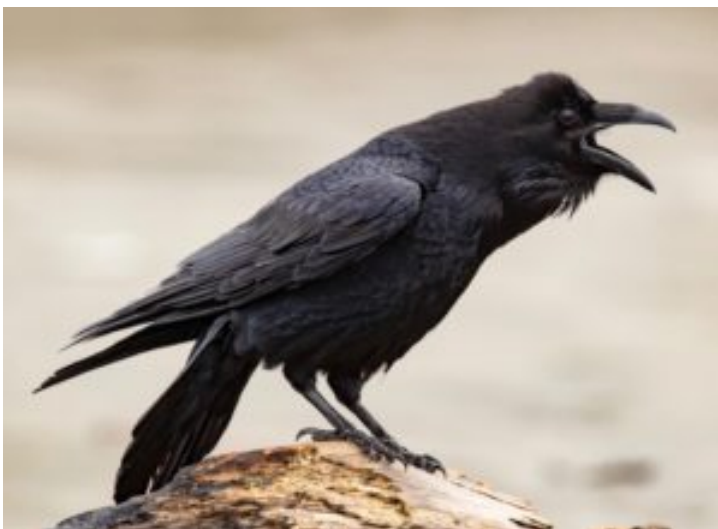
Common Raven