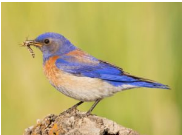
Western Bluebird

Evergreen Audubon began the Bear Creek Watershed Breeding Bird Atlas (BBA) in 2008, and like other BBA's that are conducted world-wide we are engaged in an attempt to provide information on the distribution, abundance, habitat preference, and breeding evidence of birds in a specific region.