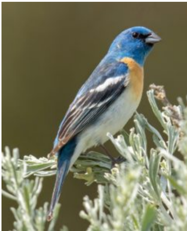
Lazuli Bunting