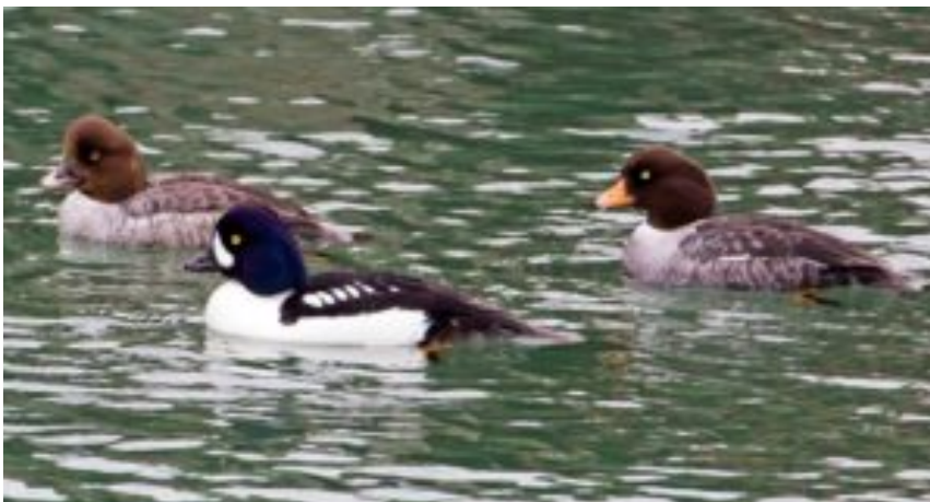
Barrow's Goldeneye

We have just completed our tenth year of gathering data on the local breeding bird community throughout the Bear Creek Watershed – from Mount Evans to the South Platte River. Within that vast area we have focused on 43 parcels of public land where we have looked for any signs of breeding: from singing males setting up territories, to courtship behavior, to nest building, to finding recently fledged youngsters. The 2017 season focused intensively on 14 main areas where we spent at least 10 hours of observation, and an additional 12 areas were visited more briefly.