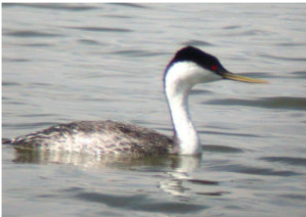
Western Grebe

Once again the destination for one of our spring bird walks was altered due to the weather. At the last minute it was decided that going to a lower elevation might be wise given the sixteen or so inches of snow received in the Evergreen area two days prior to the walk. WHAT A GREAT DECISION!