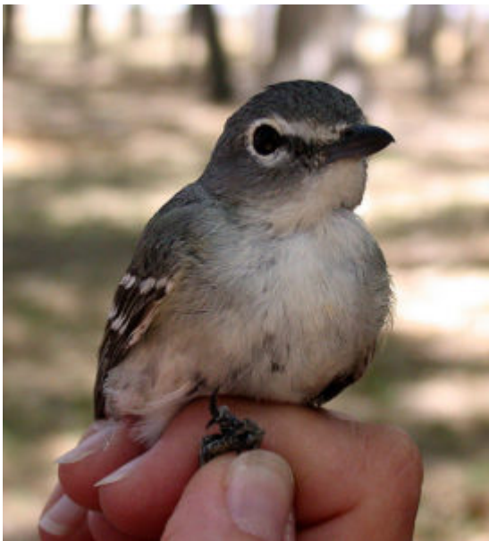
Plumbeous Vireo

Beyond just listing the birds seen, we had multiple discussions on such topics as 1) identifying Green-winged Teal that are a quarter-of-a-mile away (vertical white bar on side), 2) a characteristic behavior of spotted sandpiper (exaggerated bobbing motion), 3) the characteristic structure and behavior of Black-chinned Hummingbird (long bill, tail and wing length comparable, regularly pumps tail), 4) how to differentiate the various swallows.... Well, you get the idea. There was a lot to discuss and learn about.