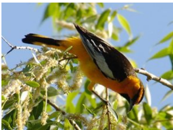
Bullock's Oriole

We also had great looks at Yellow Warbler, Yellow-breasted Chat, Western Tanager, and Bullock's Oriole.