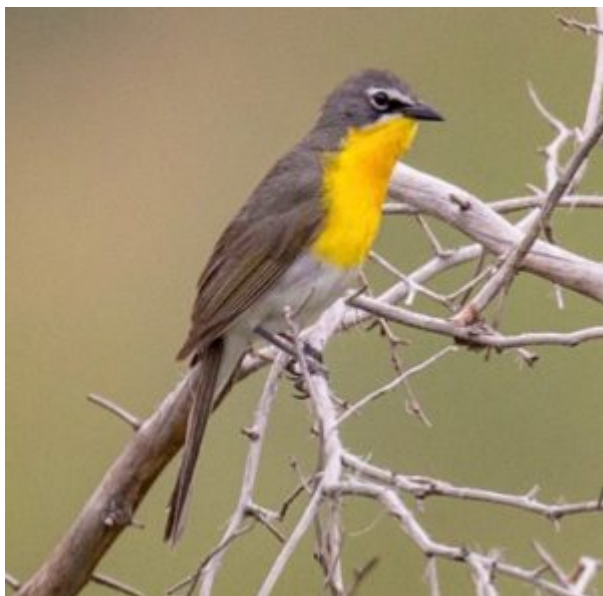
Yellow-breasted Chat

As a consequence, fourteen of us were very entertained by 54 species of birds at Bear Creek Lake Park (see list below). Needless to say the highlights were numerous. How about Cinnamon Teal, Western Grebe, and an adult Bald Eagle for starters.