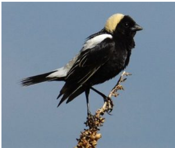
Bobolink