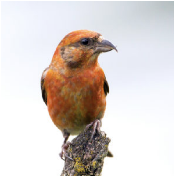
Red Crossbill

It was a treat to work our way through identifying three species of Sparrows: American Tree Sparrow, White-crowned Sparrow, and Song Sparrow. On the Tree Sparrow note the bi-colored bill, long tail, rufous crown, white wing-bars, rufous coverts (shoulders), central breast spot, and almost no streaking on the breast and belly.