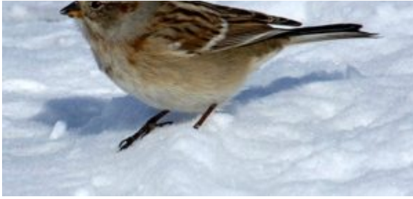
American Tree Sparrow

It was a treat to work our way through identifying three species of Sparrows: American Tree Sparrow, White-crowned Sparrow, and Song Sparrow. On the Tree Sparrow note the bi-colored bill, long tail, rufous crown, white wing-bars, rufous coverts (shoulders), central breast spot, and almost no streaking on the breast and belly.