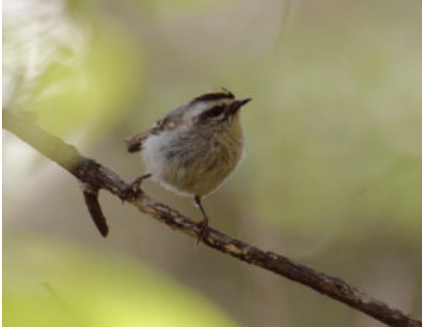
Golden-crowned Kinglet

7-8 species. Fortunately, being hardcore Evergreen Audubon members we persevered through a few spells of bad anecdotes from the trip leader and others, and eventually tallied 23 species, having had some very special sightings (see list below).