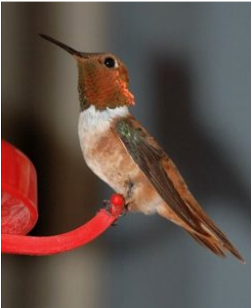
Rufous Hummingbird

Here in Evergreen it is easy to attract hummingbirds to your yard with both feeders and flowers (see list below). With feeders simply make a 1:4 white sugar to water mix, don't add any food color, and then make sure to clean your feeders regularly. Extra mix can just be refrigerated. The color red is a big attractant, so having red feeders helps, and you can even put up red flagging if you're impatient for results. Also, try and have feeders with some sort of bee guard on them to help frustrate the Hymenoptera. Finally, don't worry about having to take your feeders down in the fall, the birds will migrate when they need to regardless of what food resources are available.