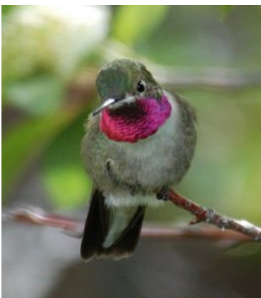
Broad-tailed Hummingbird

This year hummingbirds arrived along the Front Range earlier than perhaps ever before. Our most common, the Broad-tailed Hummers started showing up in mid-March (almost a month earlier than we used to expect them), and our less common Black-chinned Hummers started appearing in early April. Two other species occur in the Evergreen area, the Rufous and Calliope Hummingbirds. Both of these have a somewhat racetrack migration, initially heading northward up the Pacific Coast, breeding to the northwest of us, and only showing up here